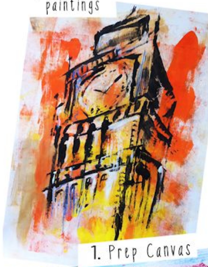
1. Prep Canvas